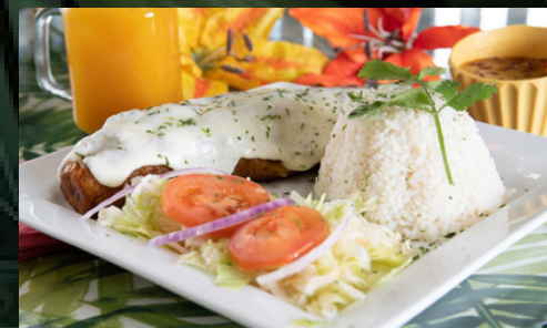
WHOLE SWEET PLANTAIN