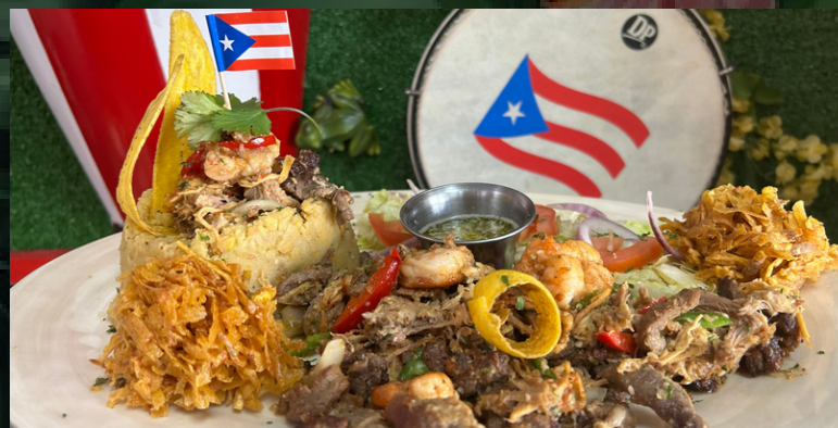
HOUSE FAVORITE SEA AND LAND PLATE 22.99